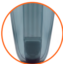
Bagless dust container