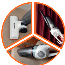
Handheld cleaner and vacuum cleaner