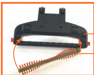
Brush bar release switch

STEP 3: To reinsert the brush bar into the mechanical floor brush, match each end of the brush bar with the corresponding tabs on the mechanical floor brush. Once aligned, gently push the brush bar into place until it's position is locked, then push the brush bar release switch to secure it.